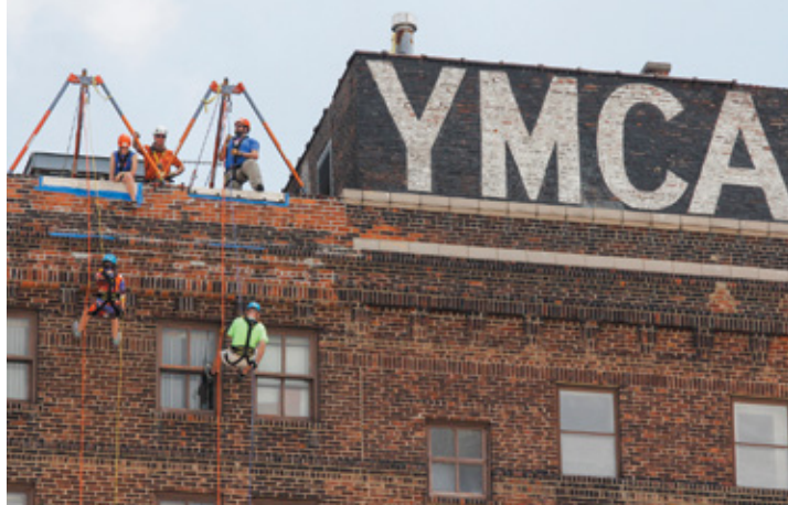
Over The Edge For Elders